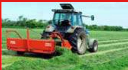
Swath wilter SV-250SE