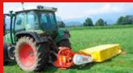
Disc mower K-240