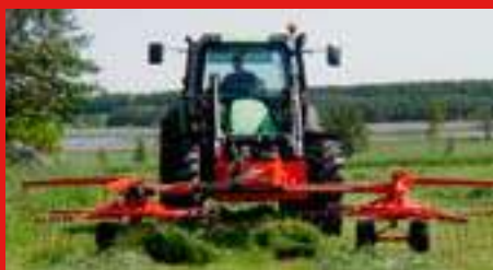
Front mounted rake TI-6000FL