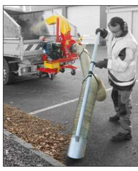
WINDY 491 RE WINDY 491 RE