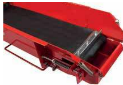
Patented cleaning outfeed conveyor as standard. The groove at the end of the outfeed conveyor separates debris from the firewood.