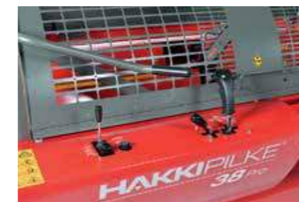
The ergonomic and easy-to-use control panel includes all the controls needed to operate the machine.