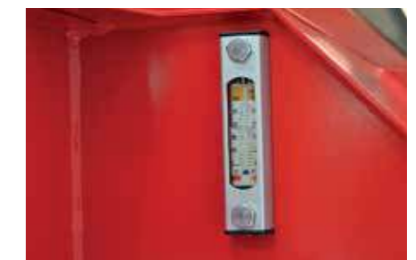
Large oil tank capacity and sight glass.

PRO SERIES WITH UNPARALLELED POWER AND EFFICIENCY