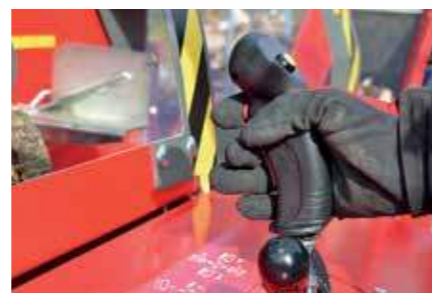
Electrical control of sawing and splitting with just two buttons.