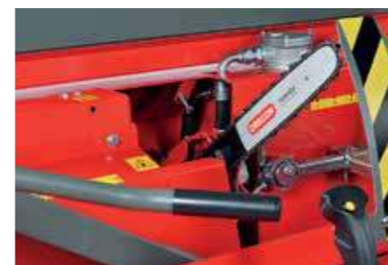
Together, the AC10 and electrical saw control ensure fast and uninterrupted operation.